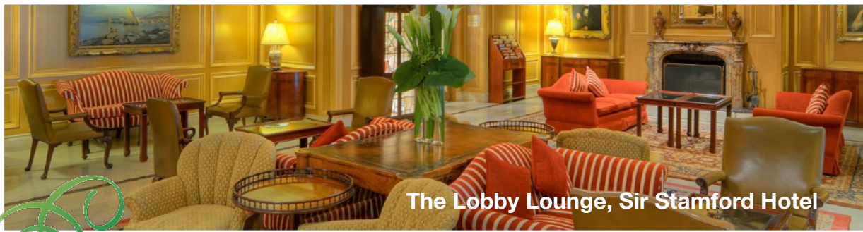
The Lobby Lounge, Sir Stamford Hotel

From the warm welcome by staff waiting on the red carpet, to the moment you step into the beautiful old-world charm of the lobby lounge, you will feel this is a special holiday!